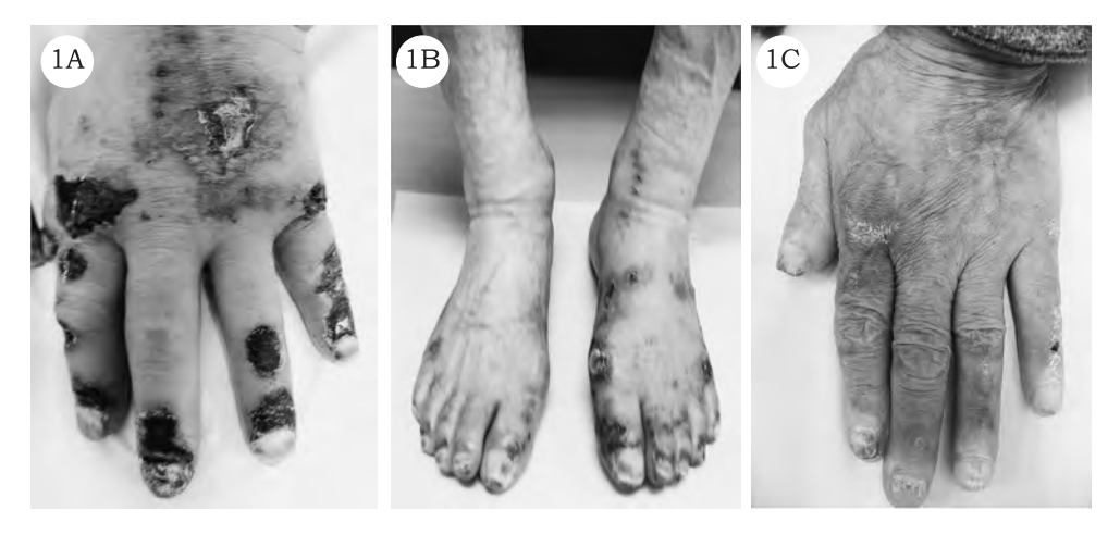
Fig. 1. Skin findings before and after chemotherapy. (1A, 1B) The hands and feet were swollen. On the dorsum, ulceration with black crusting and a reddish hue of the surrounding skin was observed. (1C) Skin ulcers were re-epithelialized after one cycle of vincristine, adriamycin and dexamethasone.