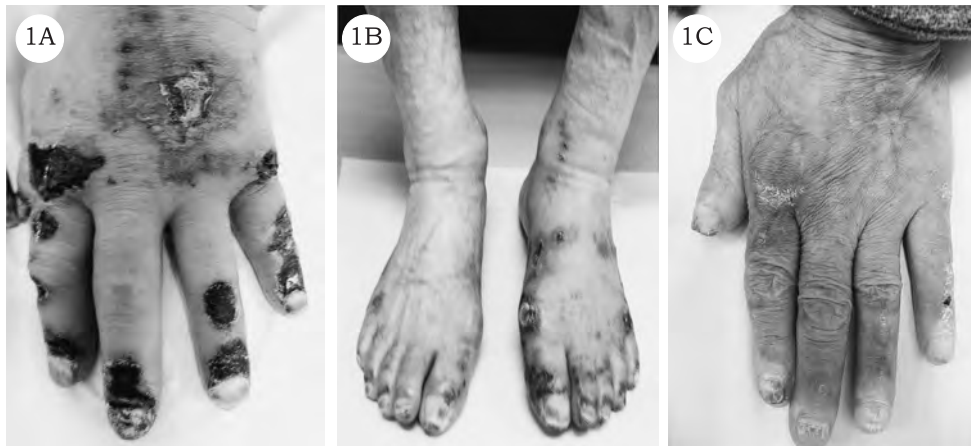
Fig. 1. Skin findings before and after chemotherapy. ( 1A, 1B ) The hands and feet were swollen. On the dorsum, ulceration with black crusting and a reddish hue of the surrounding skin was observed. ( 1C ) Skin ulcers were re-epithelialized after one cycle of vincristine, adriamycin and dexamethasone.